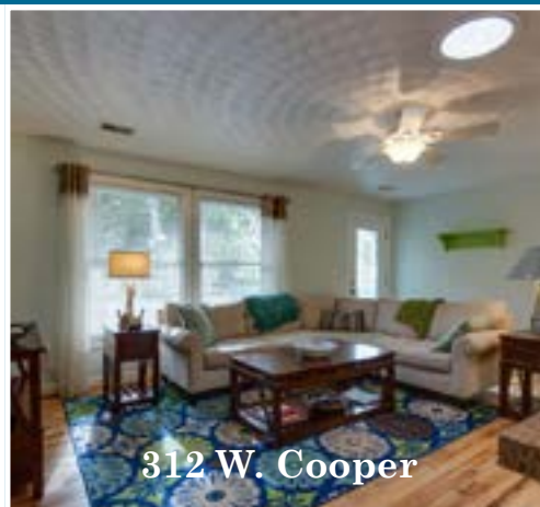
312 W. Cooper