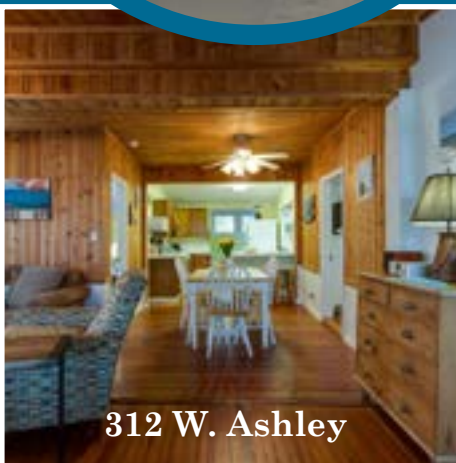
312 W. Ashley