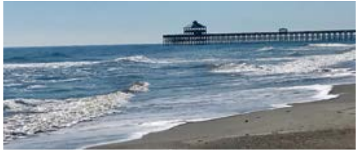
Folly Pier is a great spot to fish, watch spectacular sunsets, enjoy a drink at the patio bar and dinner at BLU Beach Bar & Grill.

Charleston Tea Plantation , the only tea planta-