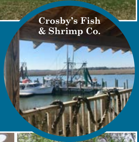
Crosby's Fish & Shrimp Co.